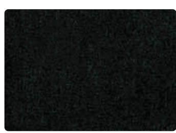
11AL Dark Grey