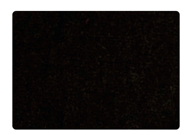
602AL Dark Brown